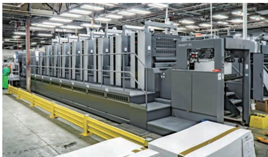
RMGT 1050LX-8 + CC + LD + UV + IR

In addition, the press includes an Eltosch UV 4-3-3 dryer for the curing of UV inks, and an IR dryer. This additional component starts the drying process when and if a conventional ink run is required. The UV dryer has four in-press UV lamps that can be relocated from unit to unit to dry trap colors, if needed. A fully