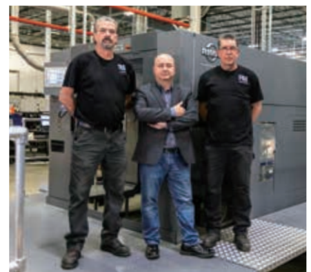
Strong service support from RM machinery, Ltd., one of RMGT's distributors in US and sole distributor in Canada