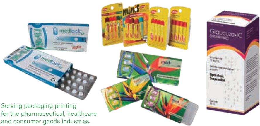
Serving packaging printing for the pharmaceutical, healthcare and consumer goods industries.

In keeping with its model of Safe, Smart, and Sustainable paperboard packaging solutions for the pharmaceutical, healthcare and consumer brands markets, this press minimizes waste by reducing the paper, inks and time required for a typical production run. Colbert's press operators see the advantages through its leading-edge monitor system with full video integration, automated quality control and advanced features that reduce downtime. Maintenance time has significantly improved