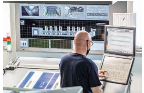
The PQS-D printing quality control system automatically sorts out defective sheets

perfecting, the 970PF-8 has two LED-UV curing units, one at the perfecting device and another at the delivery section, that instantly dry both sides of the printed sheets, enabling the company to offer much shorter delivery times. Bruni also