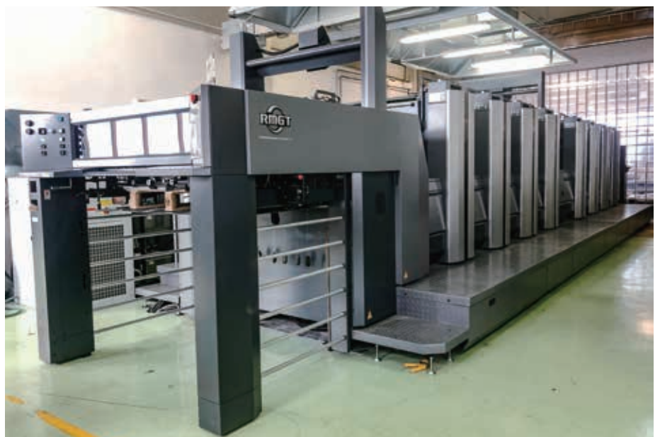
970PF-8 + LED-UV curing units + PQS-D (I+C+R)

Of fundamental importance was the ability to access the latest generation of technologies with a machine that handles 650 x 965 mm paper.