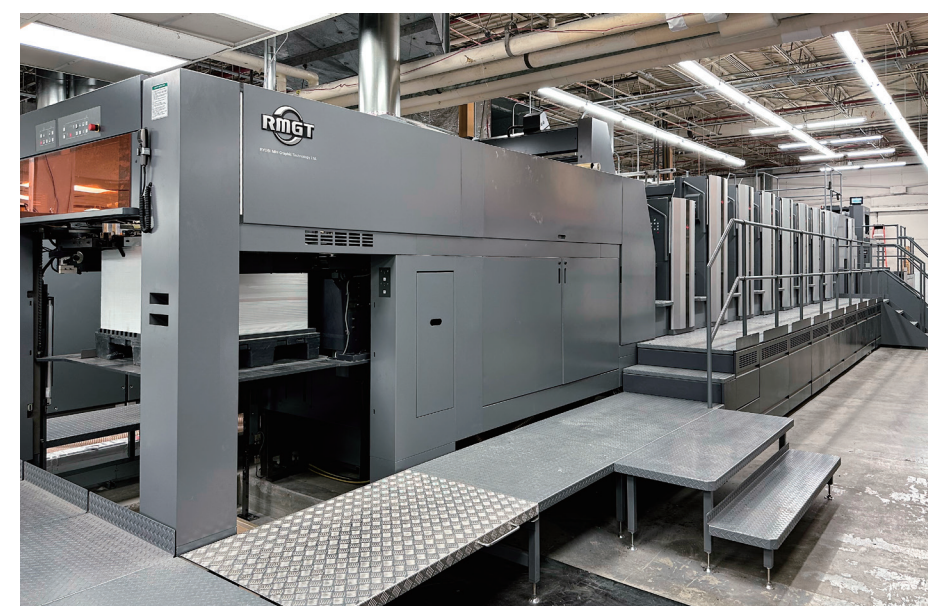
1060TP (7/1 color) + CC + LD

Relevant Packaging has the advantage of earning its customers' confidence in the RMGT 10 series by showcasing the equipment's