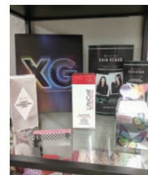
Using UV printing to produce high-end cosmetics packages

The company operates out of 60,000 ft 2 of production space with warehousing in three buildings in Sun Valley, CA, where they routinely prints anywhere from 10,000 up to tens of thousands of folding cartons that make up its portfolio of UV-coated, sharp-looking printed cosmetics, food and related packaging for dramatic "stand-out-on-the-shelf" impact.